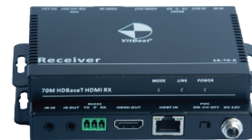
EB-70-TR 70M Extender Set