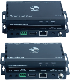
EB-100-TR 100M Extender Set

HDBaseT technology is a consumer electronic (CE) connectivity technology optimized for whole-home and commercial multimedia distribution.