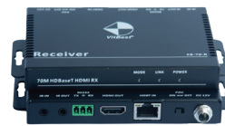
EAWP-100-TR 100M Wall Plate Extender Set