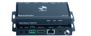
EAWP-VH100-T 100M HDMI, VGA Wall Plate Extender Set